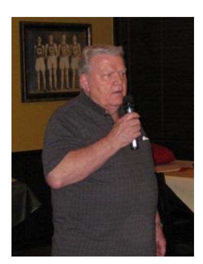
Ye Olde Pres