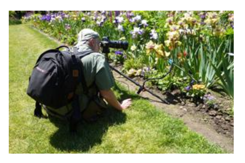
On June 3, 5 members visited Schreiner's Iris Garden north of Salem. The display gardens were endowed with a rainbow of bearded irises, alliums and peonies. A brief snack lunch was enjoyed under a nice shade tree. Then, some of the FPCC members continued on to Silver Falls for a short hike to capture shots of South Falls, a 177-foot waterfall. Sunny skies made for a delightful afternoon.