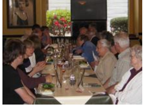
Even the judges were there. Thanks for your help.